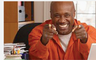
128 Weekly Prizes: $100 American Express® Reward Cards 2