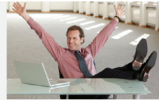
Grand Prize: $10,000