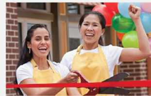
First Prize: $2,500